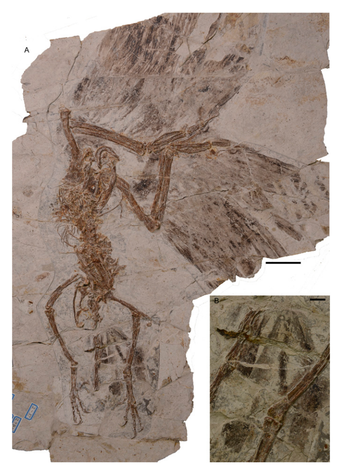
Fig. 1. Jeholornis sp. STM2-37 preserving the proximal tail fan in situ forming a horizontally oriented fan, or aerofoil. (A) Full slab. (Scale bar: 5 cm.) (B) Close up of the proximal fan. (Scale bar: 1 cm.)

comparable in rachis thickness with the remiges and proximal tail feathers (0.366–0.398 mm), their vanes are narrow and curved and taper sharply along their distal thirds. The vanes are preserved in only two specimens, and it is unclear whether they are symmetrical. In STM2-11, only the caudal half of each vane is preserved whereas, in SDM 20090109, the feathers appear symmetrical on one side of the tail and asymmetrical on the other.